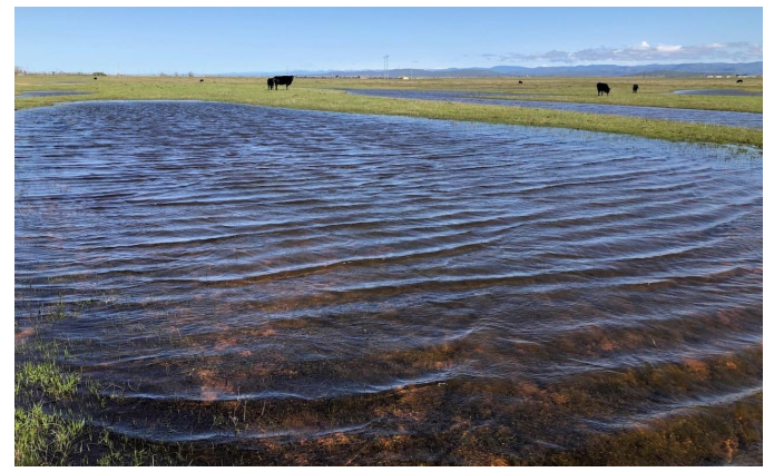
One of the many vernal pools at Beale AFB.

Beale AFB is hosting a basewide Vernal Pool Tour. Vernal pools are the shallow, seasonal depressional wetlands that contain water from the rainy season for only part of the year, and host unique plant and animal life that can survive through both the saturated and dry seasons.